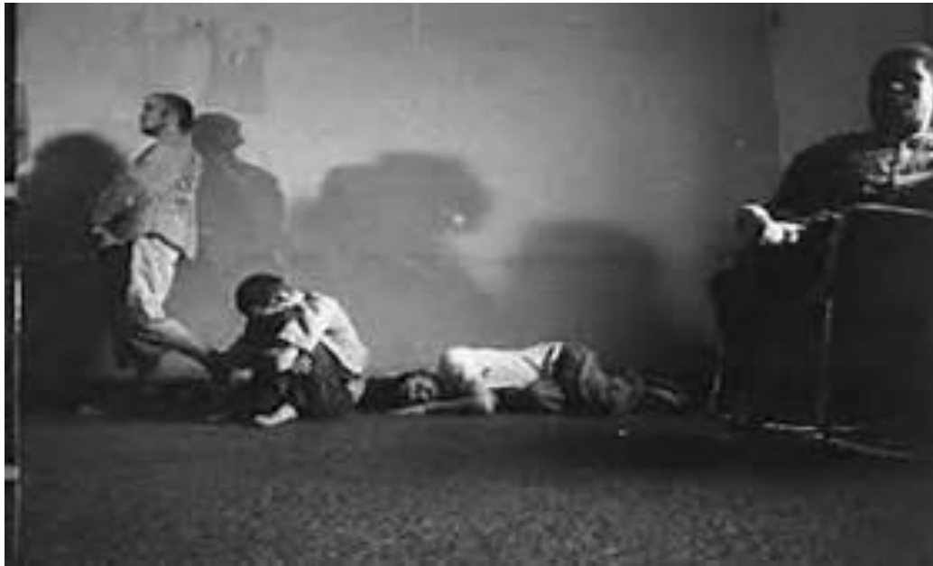
Willowbrook State School, Staten Island, NY 1972

But, not all individuals with disabilities were marching in the streets