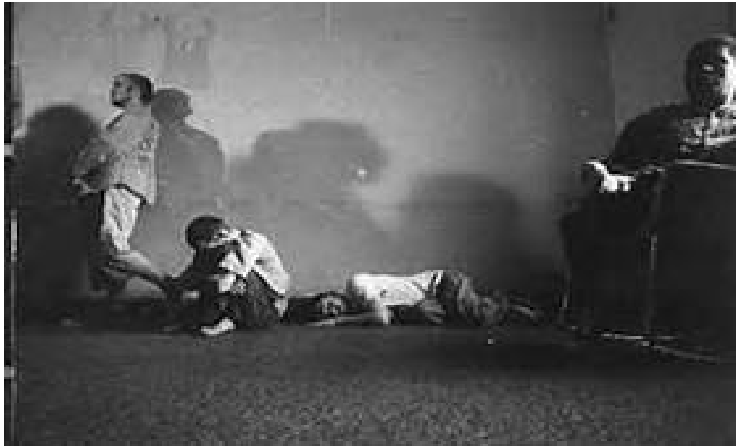
Willowbrook State School, Staten Island, NY 1972

But, not all individuals with disabilities were marching in the streets